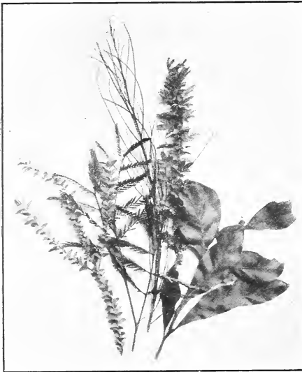
ACACIA CULTRIFORMIS ACACIA BAILEYANA ACACIA SALIGNA ACACIA EXTENSA